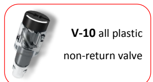
V-10 all plastic non-return valve