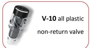
V-10 all plastic non-return valve